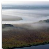
Upper Coastal Plain