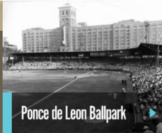
Ponce de Leon Ballpark