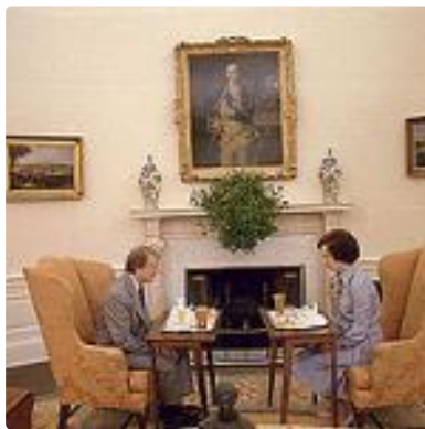
Jimmy and Rosalynn Carter

James Earl Carter Jr., known as Jimmy, was born in Plains, Georgia, in 1924. After first attending Georgia Southwestern College (now Georgia Southwestern State University ) and the Georgia Institute of Technology , Carter graduated in 1946 from the U.S. Naval Academy in Annapolis, Maryland. That same year he married Plains native Rosalynn Carter. He began service in the navy, which lasted until his father's death in 1953, when Carter returned to Plains to run the family business.