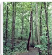
Piedmont Geographic Region