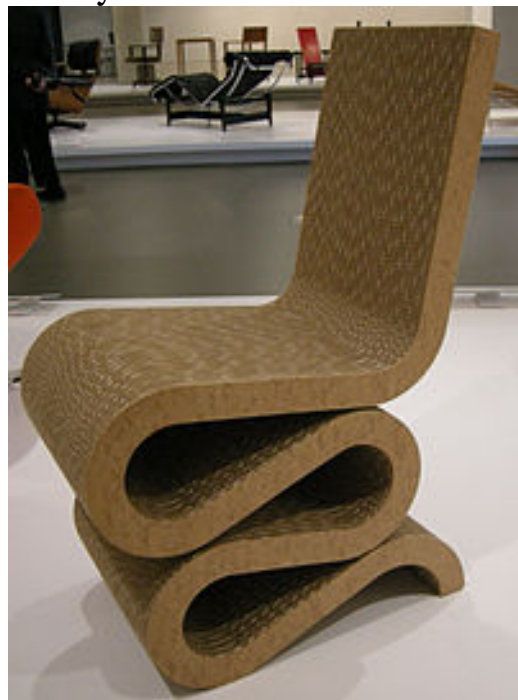
Wiggle side chair

In April 2014 Gehry designed a set for an "exploration of the life and career of Pierre Boulez " by the Chicago Symphony Orchestra , which was performed in November of that year. [77]