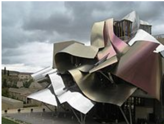
Hotel Marqués de Riscal in Elciego, Spain (2006)