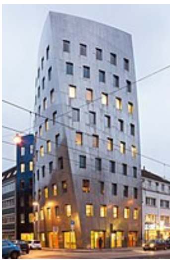
Gehry Tower in Hanover, Germany (2001)