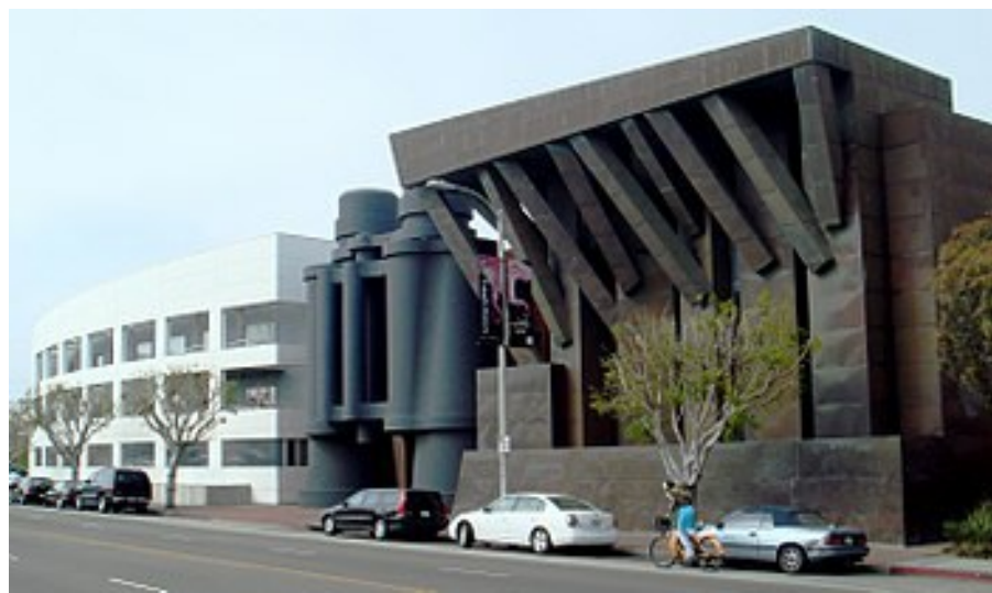
Chiat/Day Building in Venice, California (1991)