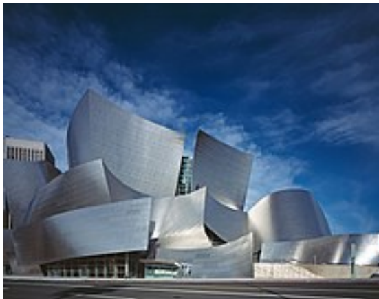
Walt Disney Concert Hall in Los Angeles (2003)