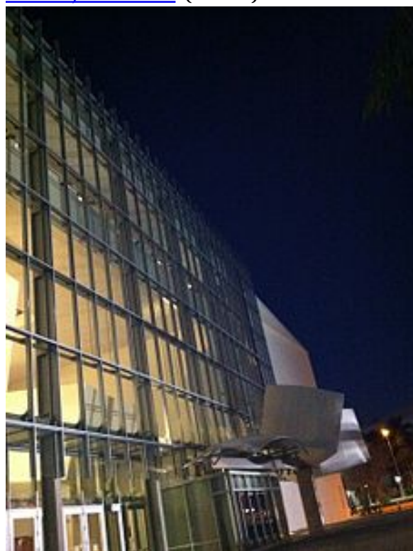
New World Center in Miami Beach , Florida (2011)