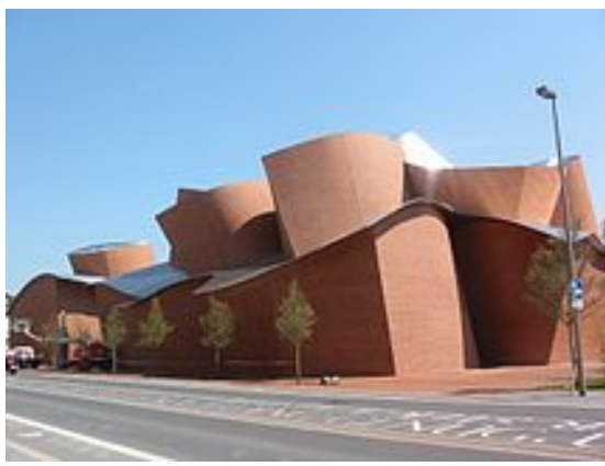
MARTa Herford, Herford, Germany (2005)