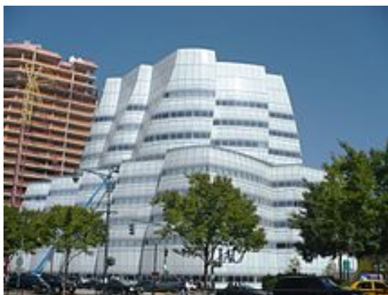
The headquarters of IAC in Manhattan, New York City (2007)