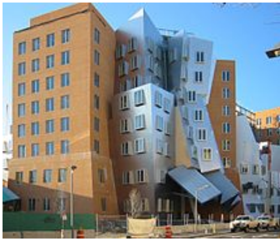
Stata Center, Massachusetts Institute of Technology, Cambridge, Massachusetts (2004)