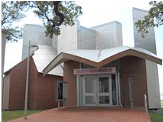
Gallery of African American Art, Ohr-O'Keefe Museum Of Art campus in Biloxi, Mississippi (2010)