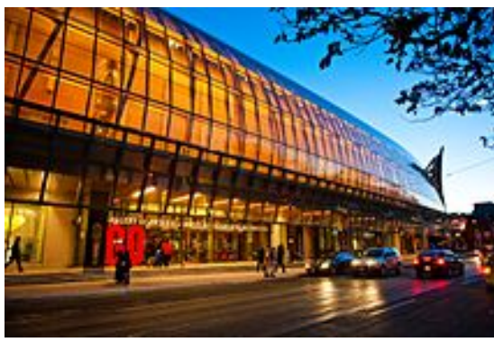
Art Gallery of Ontario in Toronto, Ontario , Canada (2008)