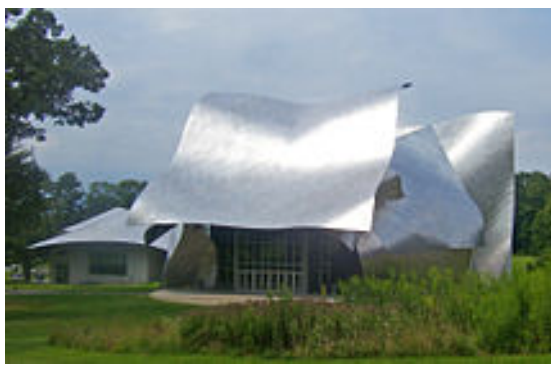
Richard B. Fisher Center for the Performing Arts, Bard College, Annandale-on-Hudson, New York (2003)