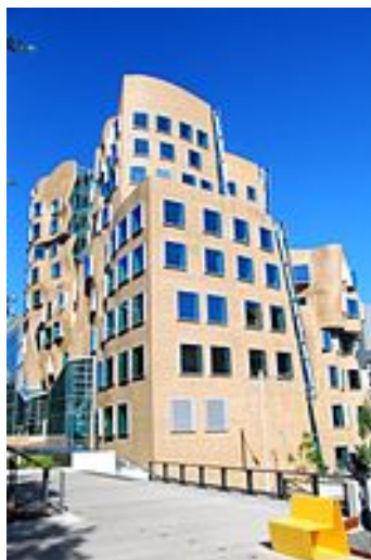
Dr Chau Chak Wing Building in Sydney, Australia (2014)