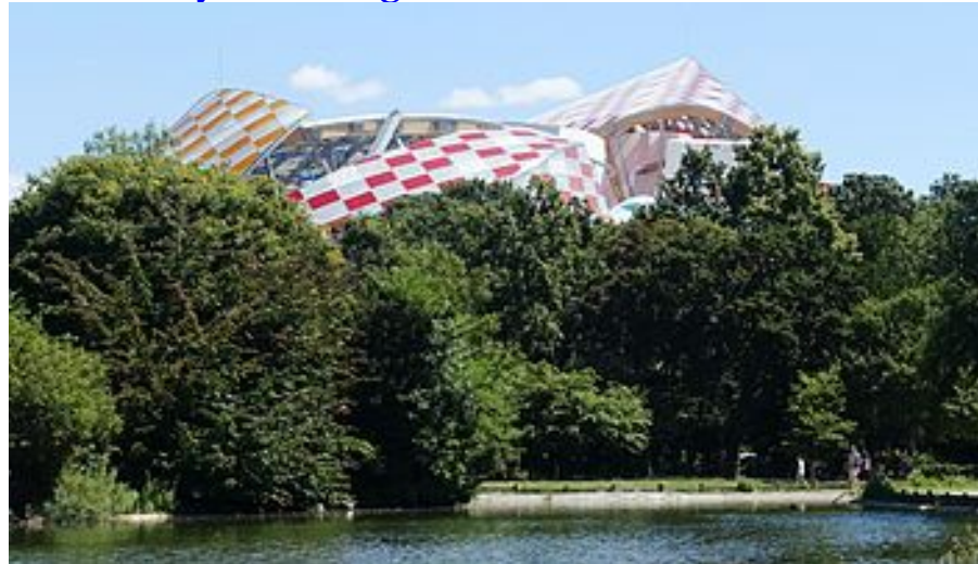
Part of the roof of the Fondation Louis Vuitton building as seen from the Bois de Boulogne in Paris, France (2016)