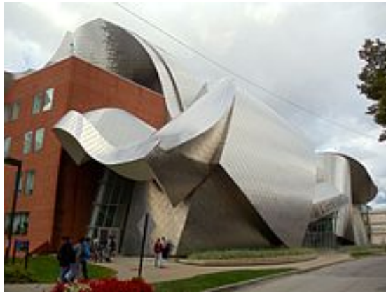
Weatherhead School of Management, Case Western Reserve University, Cleveland, Ohio (2002)