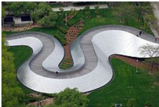
BP Pedestrian Bridge, Millennium Park, Chicago (2004)