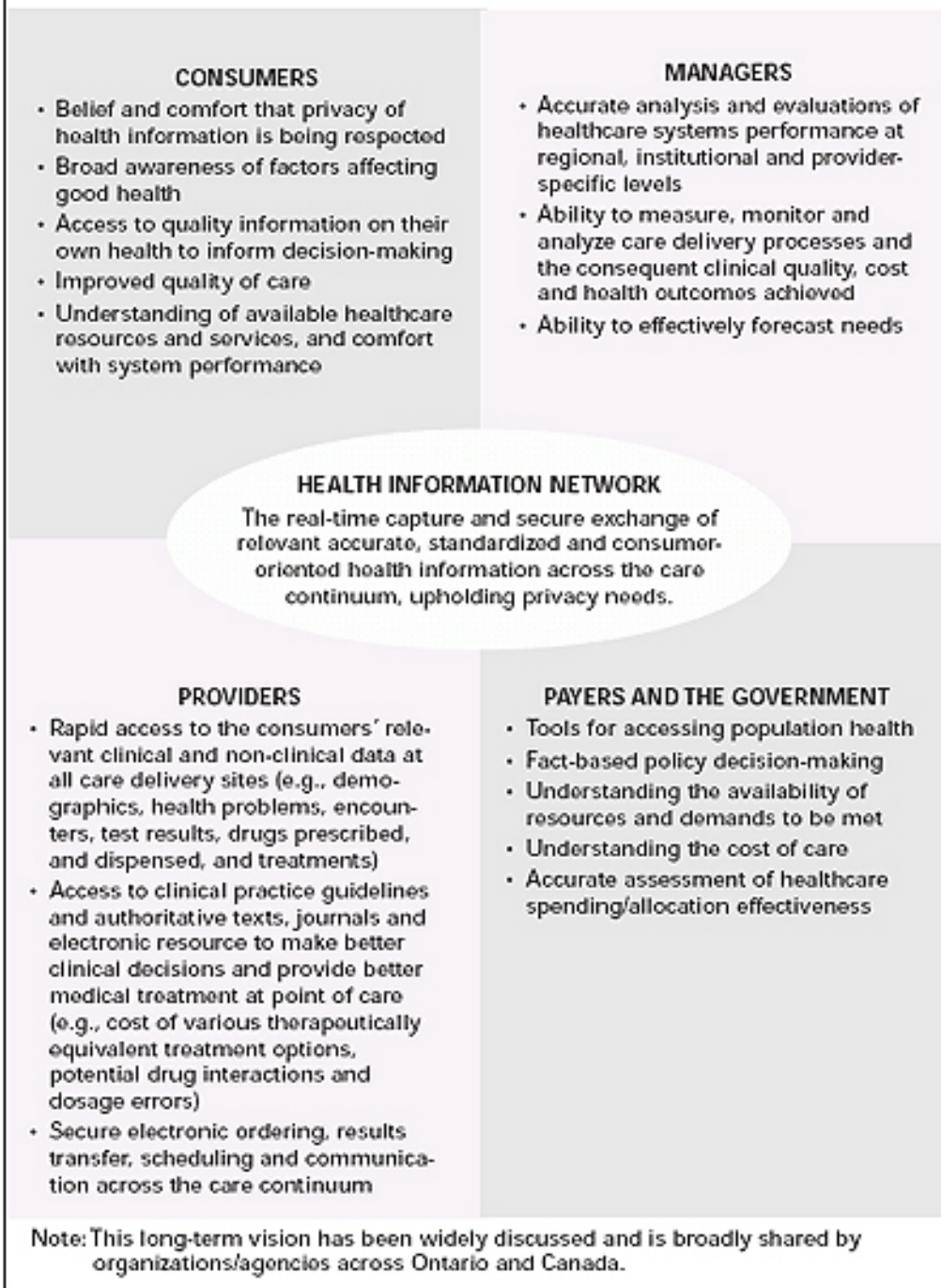
Figure 2: Long-Term Vision of an Integrated Health Information Network