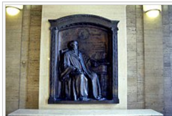
Angell by Bitter