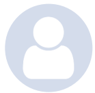
Daniel C. Dennett Tufts University