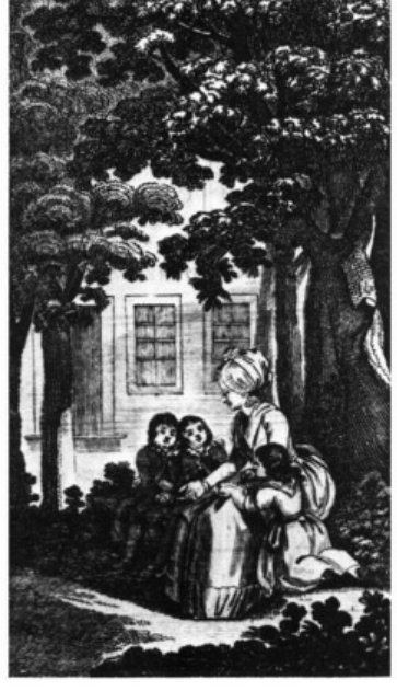
Click for larger view View full resolution

This typically educative Georgian mother is wearing the more formal style of the 1780s. (Frontispiece to Wollstone craft's adaptation of C. G. Salz, Elements of Morality [London: J. Johnson, 1791].)