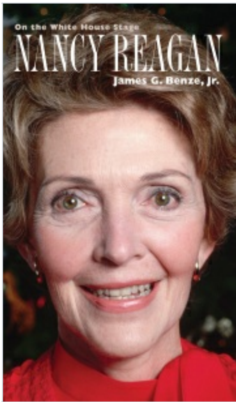
Table of Contents Nancy Reagan: On the White House Stage