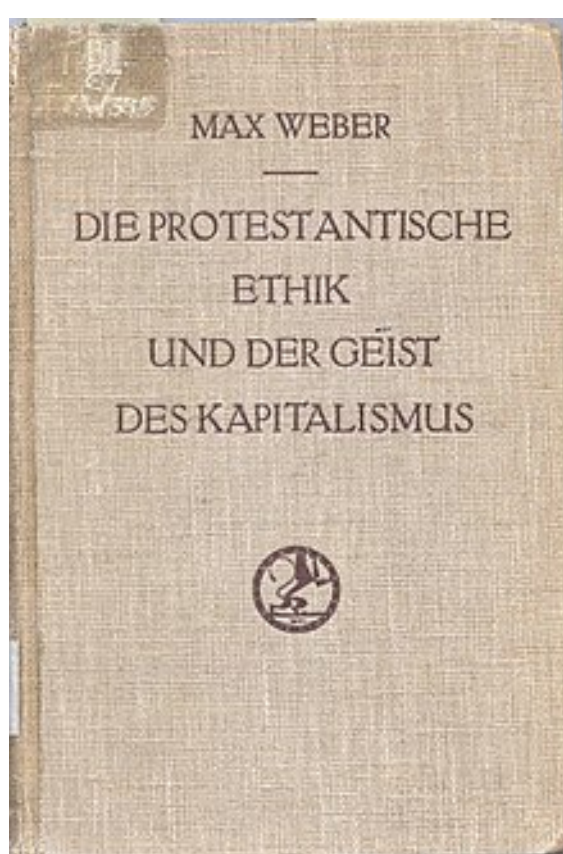
Cover of the German edition from 1934

Although not a detailed study of Protestantism but rather an introduction to Weber's later studies of interaction between various religious ideas and economics ( The Religion of China: Confucianism and Taoism , The Religion of India: The Sociology of Hinduism and Buddhism , and Ancient Judaism ), The