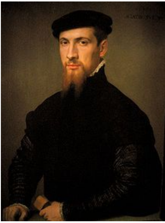
Simon Renard, Spanish Ambassador to England

John Elder shared many details about the ceremonies which marked the marriage between Mary and Philip in the summer of 1554. Philip had “landed at Southampton in Hamshire, within ten mile of the cite of Winchester, on Friday the xx day of July at iii of the clocke at afternone” and was met by “the lords of the counsel and diverse other noble men” (Nichols The Chronicle of Queen Jane 137-138). Philip rode through Winchester “on a faire white horse, in a riche coate embroidered with gold, his doublet, hosen, and hat suite-like” (Nichols The Chronicle of Queen Jane 139).